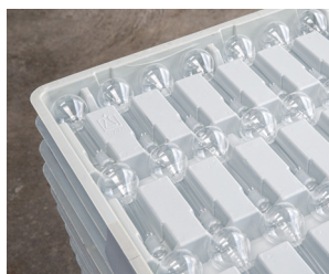
Reusable packaging for production materials