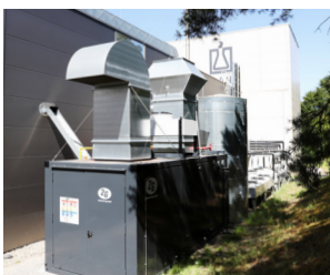
Combined heat and power unit