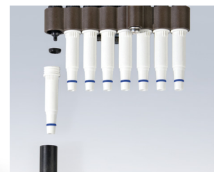
Individually exchangeable shafts on the Transferpette® S-8 and -12

Easy maintenance thanks to patented technology