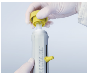
High-quality materials ensure long service life