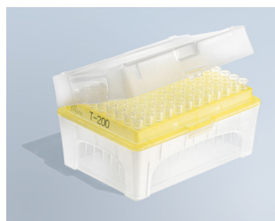
The TipBox can be reused, and autoclaved multiple times