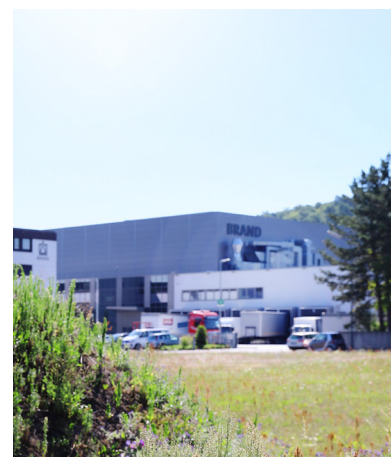
Our factory in Wertheim

We focus on saving as many resources as possible in production ( Reduce ) by designing our products to be long-lasting and maintenance-friendly ( Reuse ) and sensibly utilizing waste that we cannot avoid ( Recycle ).