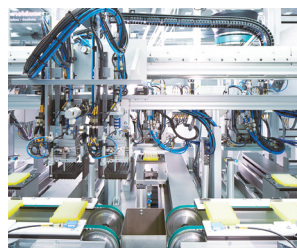
Production of thin-walled pipette tips