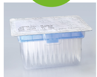
TipRack refilling system for pipette tips